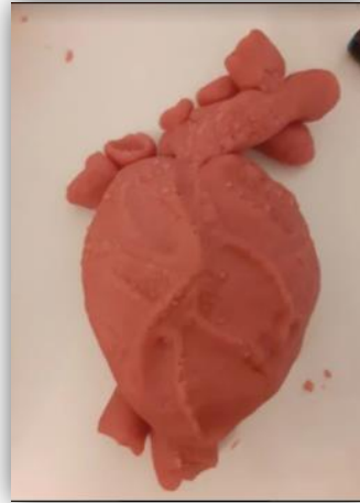
Peyton created a model of the heart linked to science learning about the circulatory system.